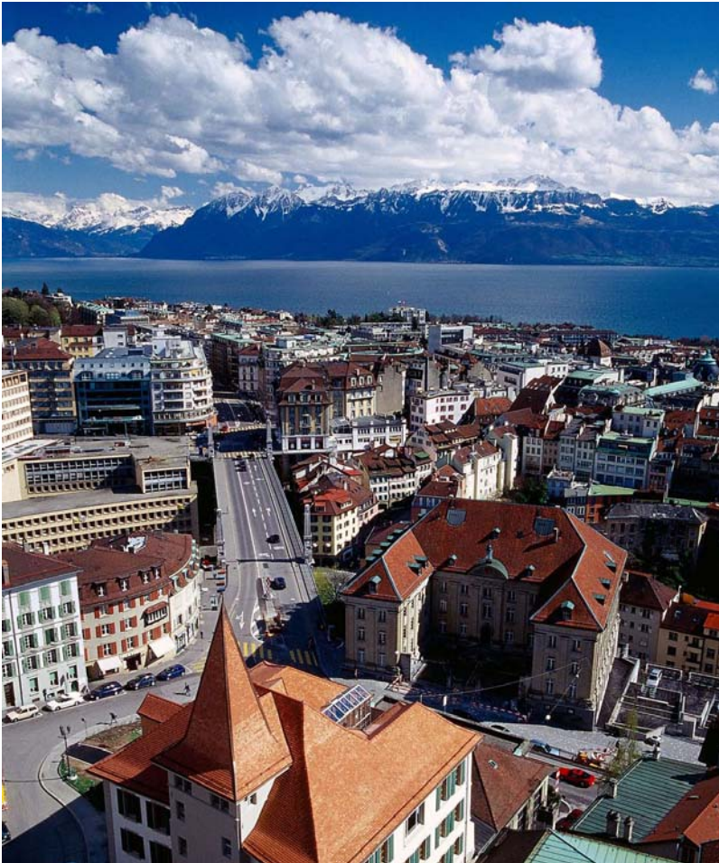
View of Lausanne, across Lake Geneva to the Alps beyond

French-speaking Lausanne is a charming city built upon three hills on the northern shore of Lake Geneva, opposite the Alps and among the vineyards which flank the lake. The towering Mont Blanc is visible across the water. Lausanne is the administrative capital of world sport; home to the International Olympic Committee and the FIG.